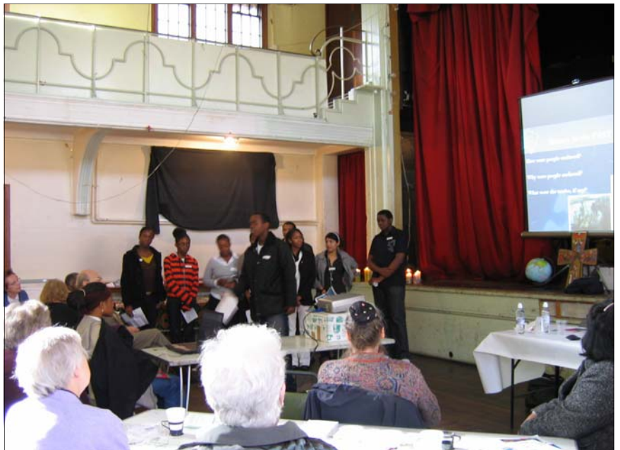
Young People from Southwark Catholic Youth Service

They ended by looking at an area which perhaps many of the audience would not have thought of - the gang culture and violence that their generation suffers from and which is